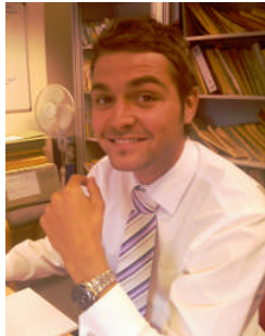
NO, not Talbots' Client Relations Manager though thinks he's good enough to make the list!