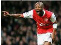
WILLIAM GALLAS for Marseille and Arsenal